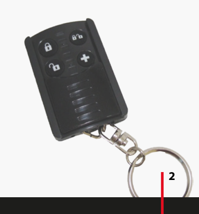
QRD - 324