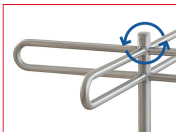
Push left or right