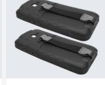
RB-RD66-RRH/ RB-RD66-RRHP Rugged Rubber Boot with hand

Rugged Rubber Boot only, omni-directional protected. RB-RD66-RR does not support charging cradle. RB-RD66-RRP is pre installed with Type C & Pogo Pin I/O connector, then it supports CRD-RD66-RBC/CRD-RD66-RBCE charging cradle.