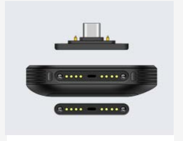
RB-RD66-P Type C & Pogo Pin I/O Connector,

clip, omni-directional protected. RB-RD66-RRC does not support charging cradle. RB-RD66-RRCP is pre installed with Type C & Pogo Pin I/O connector, then it supports CRD-RD66-RBC/CRD-RD66-RBCE charging cradle.