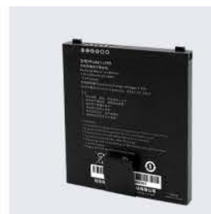
BTRY-RD66-43MA 4300mAh Li-ion battery, 3.8 output