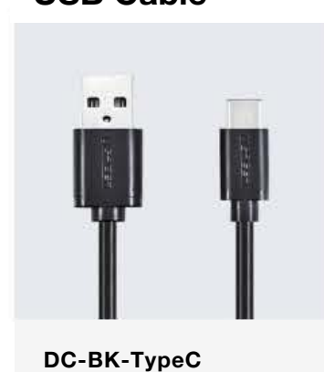
1.0 meter Type-C cable